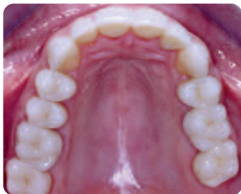
Total restoration with IPS e.max (Prof Dr D Edelhoff / O Brix, Germany)

IPS e.max is the sum of many good ideas. The system allows you to select the most suitable all-ceramic material, depending on the indication at hand and the required strength of the restoration.