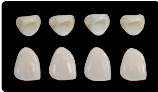
IPS e.max Ceram on four different materials (from left to right): IPS e.max Press, IPS e.max ZirPress, IPS e.max ZirCAD, IPS e.max CAD MDT T Michel, Germany

You will appreciate the benefits offered by the fact that the IPS e.max system features only one layering ceramic. You can choose a suitable framework material, for example, lithium disilicate ceramic or zirconium oxide, depending on the indication to be treated and the required strength. Your dental technician will veneer all the different IPS e.max frameworks with the highly esthetic IPS e.max Ceram layering ceramic to impart the restorations with individual character and natural-looking vibrancy.