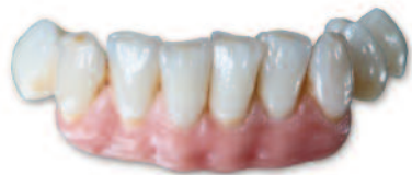
IPS e.max restoration with gingival parts MDT T Michel, Germany

Irrespective of the framework material you choose, IPS e.max Ceram allows you to smoothly integrate different types of restorations. Since all the IPS e.max restorations are veneered with the same ceramic material, they exhibit the same wear properties and surface gloss. The outcome is a uniform esthetic appearance.