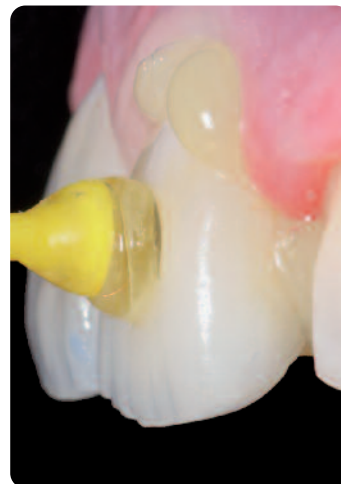
Cementation with Variolink Veneer (Dr S Kina, Brazil / A Bruguera, Spain)

In general, lithium disilicate (LS 2 ) is etched before it is placed. Before restorations are placed with adhesive or self-adhesive cementation materials, they are conditioned with Monobond S. The Metal/Zirconia Primer is used to treat zirconium oxide before the restorations are seated.