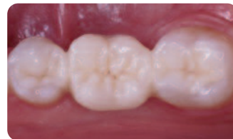
IPS e.max ZirPress/ZirCAD inlay-retained bridge adhesively luted with Multilink

"All-ceramic inlay-retained bridges offer an interesting treatment option for the future, as they involve a minimally invasive technique and show outstanding esthetics. The framework structure made of the partially sintered zirconium oxide ceramic in combination with a glass-ceramic (IPS e.max ZirPress) seems to have solved the strength problem at last."