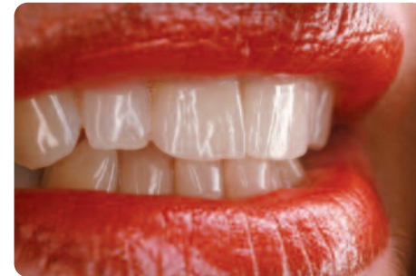
IPS e.max Ceram on IPS e.max CAD (Dr A Kurbad / K Reichel, Germany)

IPS e.max allows you to offer your patients exceptionally beautiful restorations which also demonstrate high mechanical strength. You are bound to appreciate the wide range of possibilities that this innovative all-ceramic system will open up to you.