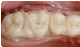
Cementation with Vivaglass CEM (Dr A Kurbad / K Reichel, Germany)

IPS e.max restorations are flexible with regard to their cementation requirements. Crowns and bridges can be cemented according to adhesive, self-adhesive and conventional methods. Inlays and veneers are cemented adhesively as usual.